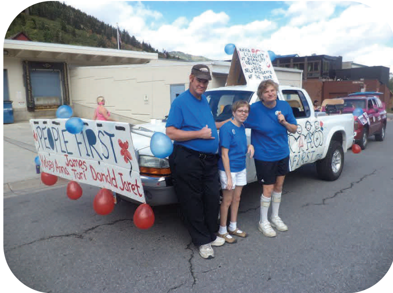
Pictured: Park City People First Members

Approximately 1,130 Utahns personally impacted by disability were engaged with public policy issues this year! The Council supported 11 organizations in these efforts which in leveraged $6,163,000 for disability related programs and supports.