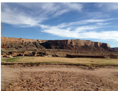
St. Christopher's Episcopal Mission Grounds