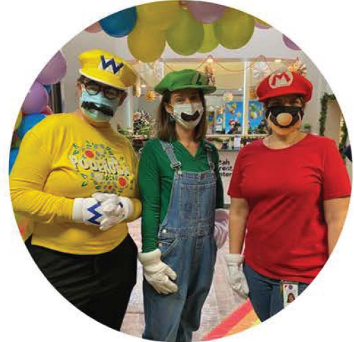
Staff preparing for a COVID-19 Vaccine clinic for kids

UDDC's activities and efforts collectively moved toward realizing our goal to support physical and mental health and safety for people with intellectual and developmental disabilities and their families. The Council works to create systemic change and improve the quality of life and health outcomes for people with developmental disabilities. Notable examples include a Council-funded project that improves training for medical students. The UDDC awarded a grant to the University of Utah School of Medicine to create educational tools to improve healthcare access and outcomes for Utahns with intellectual and developmental disabilities (I/DD). The primary purpose of this project is to amplify the voices of persons with I/DD and their families in rural healthcare settings. The U of U also aims to expand and support medical education for University of Utah School of Medicine (UUSOM) students, preparing them for active roles in both the support and advocacy of patients with significant disabilities living in rural Utah. The Council is also collaborating with several organizations to improve access to education