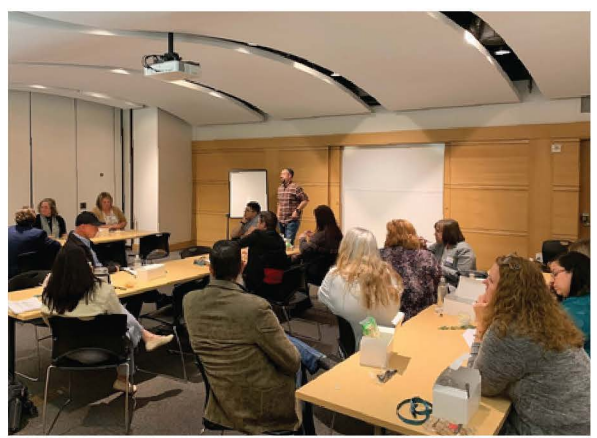
Workgroup participants at an event to support Utah's caregivers

UDDC and its partners formed a coalition to address the lack of support for Utah's caregivers. This healthcare crisis can result in mental and physical fatigue or injury. More than one in five Americans are serving as family caregivers. These caregivers assist older adults and people with disabilities to live more independently. This assistance can improve dignity, self-determination, and a better quality of life. An estimated 450,000 adults in Utah